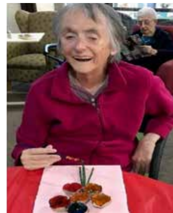
TABLE BOBS IN MARI MA