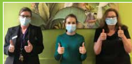
Thumbs up for the Mask-Up!

Of course, if you're a keen sewer and would like to make masks for others, we'd love to hear from you!