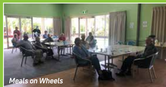
Meals on Wheels

Research from the University of Oxford* identified that people who eat together with others are happier and more satisfied with their lives. With the easing of COVID-19 Public Health Orders, we are expanding options for dining including Everbean Café; Meals on Wheels Community Restaurant (Fridays) and the Lodge Dining Rooms. If you usually eat alone, we encourage you to treat yourself and meet up with a friend or family to share a meal or a coffee!