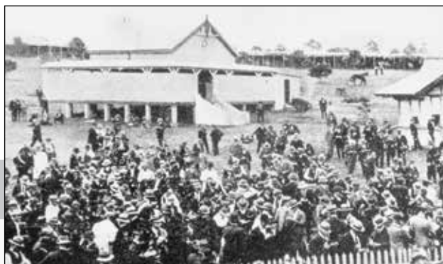
Gosford Racecourse crowds, 1923