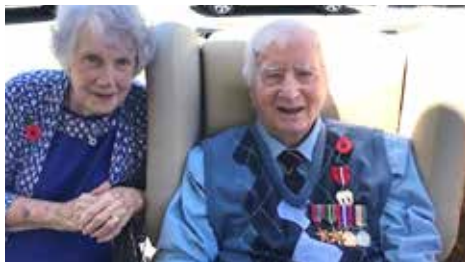
Lodge residents had a lovely Remembrance Day morning tea and laid wreaths at the Memorial.