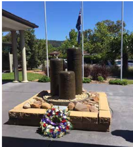
Village residents remember...